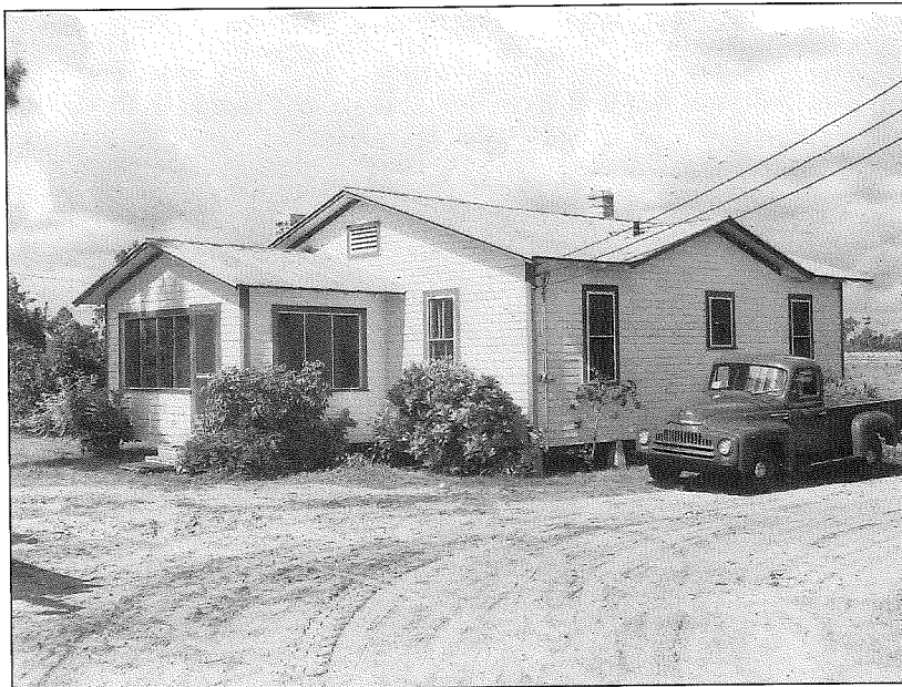
This county-owned frame house served as the office-laboratory from 1946 to 1950.

The first major step toward the establishment of a permanent agricultural research laboratory was the execution of a renewable lease by St. Lucie County to the State Board of Education. The County Commissioners'