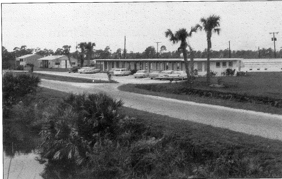
View of the Indian River Field Laboratory - 1961.