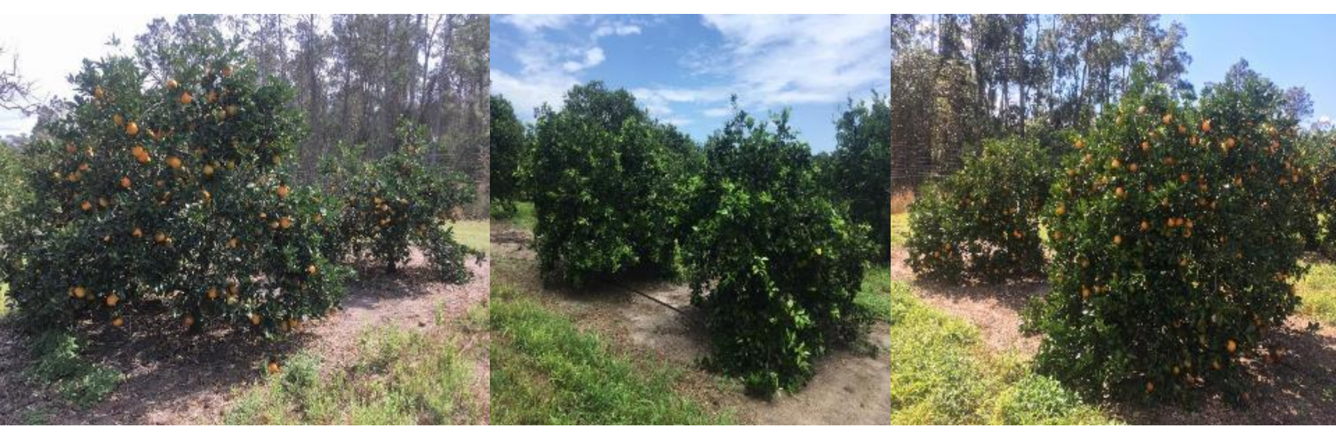
Valencia on UFR-17, February 2018