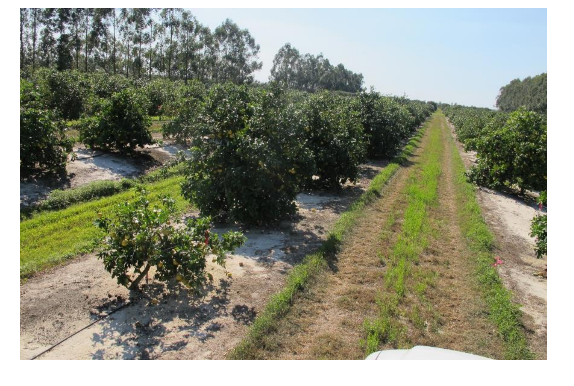
Premier Grapefruit Rootstock Trial – Fort Pierce Several new citranges performing well!