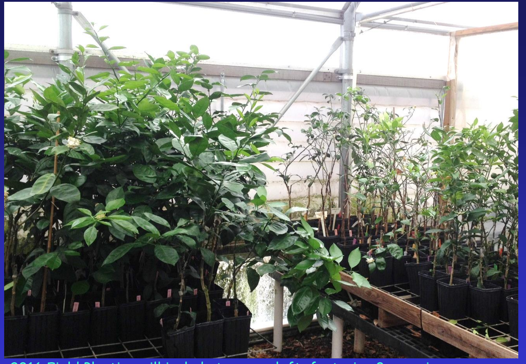
2016 Field Planting will include trees on left; featuring 3 superior crosses: C2-5-12 pummelo x papeda; A+HBP \times White 1 and A+HBP \times Sour orange+rangpur. Candidates on left already passed through the 'hot psyllid' house.