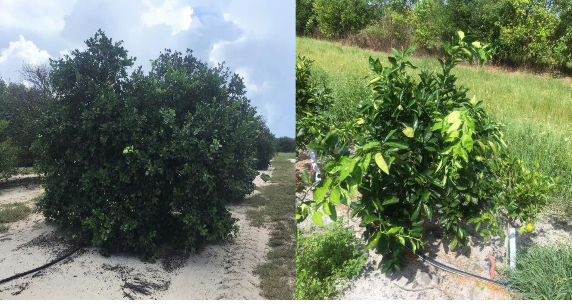
Sour+Rangpur Seed Tree