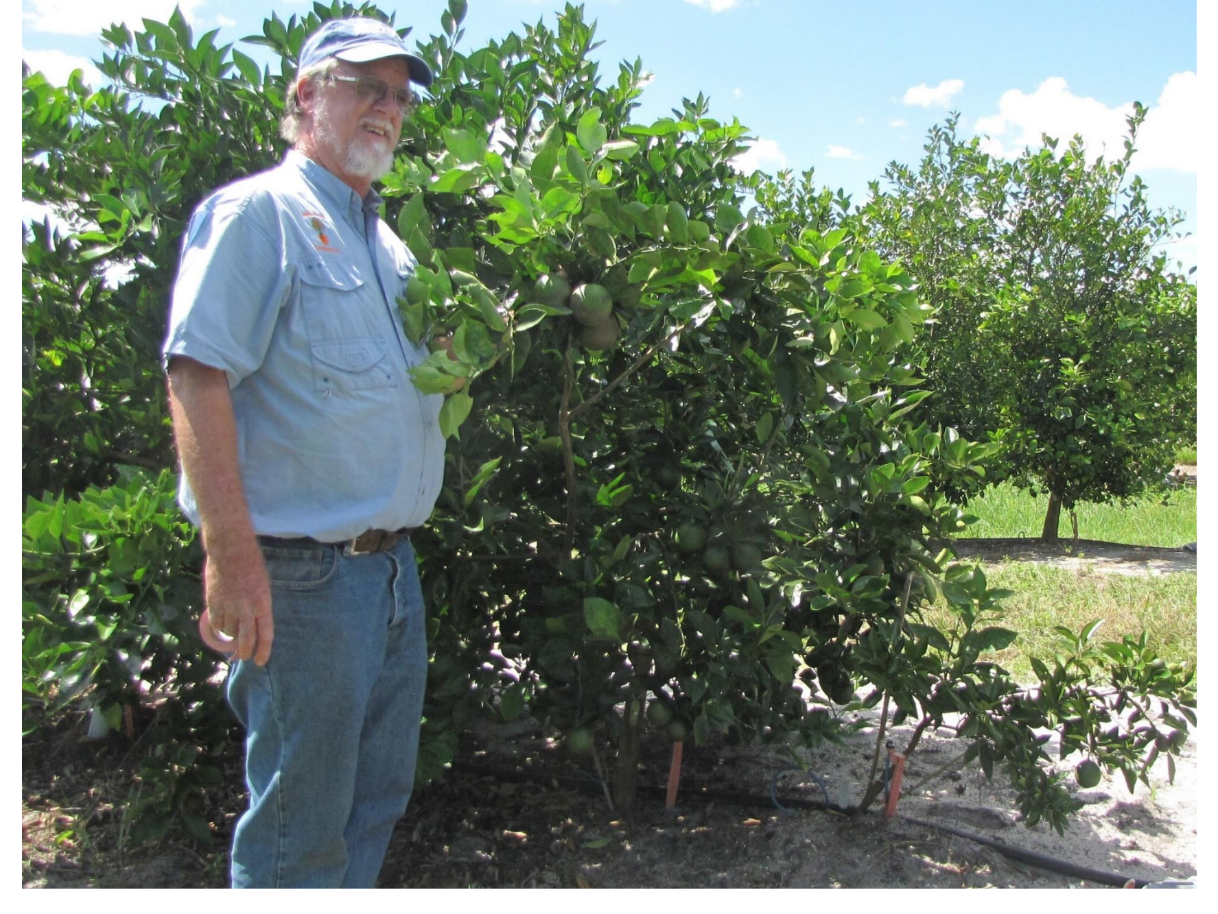
3-year old Valencia on gauntlet rootstock A+HBPxSORP-13-60 at USDA Picos Farm, planted HLB+, now HLB-negative (photo from October, 2019).