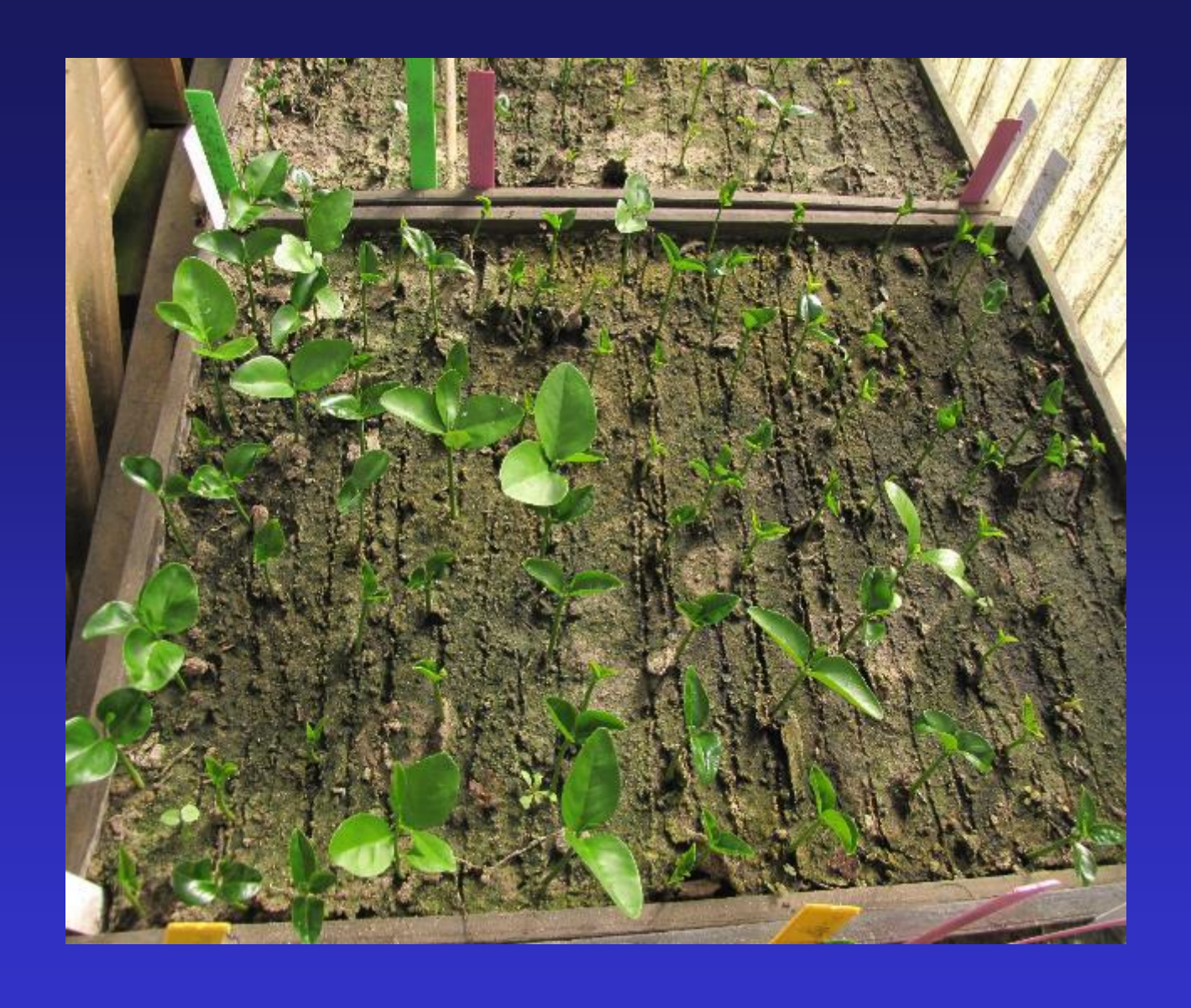
Rootstock cross with good Phytophthora resistance.