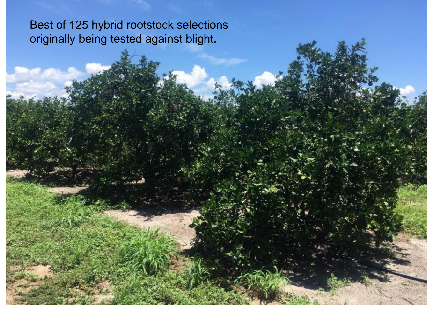
9-year old Valencia on 46x20-04-6 (HB Pummelo x Cleo) grown at Lee Alligator Grove (St. Cloud) with no psyllid control and no special nutrition.