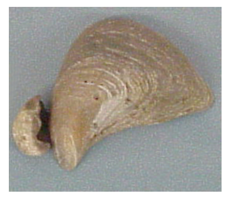
American Oyster Crassostrea virginica