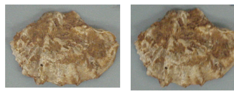
6 Education on the Halfshell: Creating A Dichotomous Key Blackline Master 4 - page 1