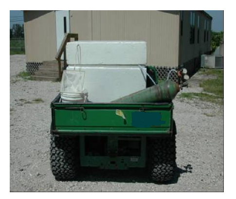
Figure 2. A transportation vehicle

when transporting fish. Poor water conditions can adversely affect the immune system of the fish, increase susceptibility to disease, and may lead to illness or death. Determine these differences before moving the fish, and, if necessary, make adjustments to the water. Then acclimate the fish. Acclimation is the process of slowly introducing the fish to different quality water to allow physiological adjustments to occur gradually over time.