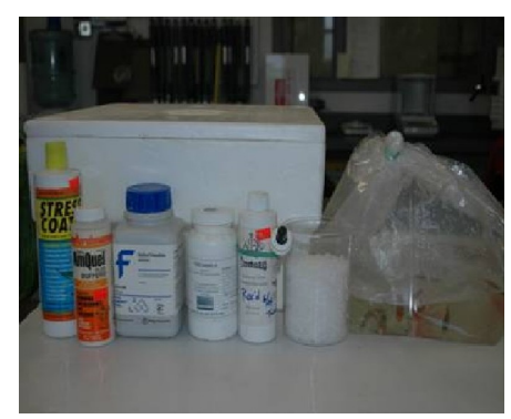
Figure 1. Typical transport additives

Typically, fish are harvested from a pond and placed into a transport container that is filled with water and covered with a lid (see UF IFAS Fact Sheet FA-117 Harvesting Ornamental Fish from Ponds ). Some commonly used transport containers in Florida include: 1) polystyrene shipping boxes, 2) plastic boxes/tubs, 3) galvanized metal tubs, 4) wood/fiberglass boxes, and 5) 55-gallon plastic barrels. Following harvest, fish are transported to a holding facility (Figure 2). The facility is generally a