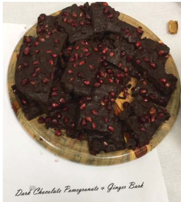
Dark Chocolate Pomegranate + Ginger Bark