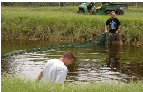
Figure 5. Seining a pond

not to overload the dip net with fish. Crowding of fish may cause fish injury and damage to their appearance.