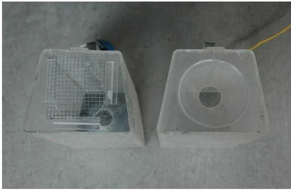
Figure 2. Acrylic trap (empty)