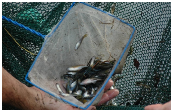
Figure 7. Dip netting fish after seining