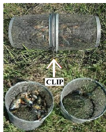
Figure 1. Wire traps

Commonly used acrylic traps (Figure 2 and Figure 3) are trapezoidal-shaped columns (e.g., 15 1/4-inch long x 6-inch tall x 5 1/4-inch wide at top and 7 1/4-inch wide at bottom). These clear traps have an inverted cone opening on one end for fish to enter the trap, a mesh covering over the opposite end for removing fish, and a metal handle on top, to which a line can be attached (Figure 2). These traps are baited (with prepared or live feeds such as small feeder fish to catch cichlids) through the inverted cone opening and hauled in by the anchor line. Grading and culling proceed in the same manner as with wire traps.