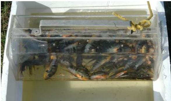
Figure 3. Acrylic trap (full)

days to obtain fish of approximately the same size. Ponds can be pumped down or drained to concentrate the fish into a smaller volume of water prior to harvest.