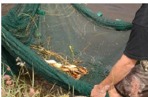
Figure 6. Concentrating catch into seine basket