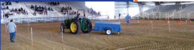
The Tractor Rodeo in progress

Culbert delivered safety presentations and fertilizer calibration best management practices for young tree plantings. Workers read fertilizer labels in front of their break-out groups; the entire group then encouraged the reader to carry out the work with a minimum amount of waste and the highest level of personal safety using chemicals, technology and equipment.