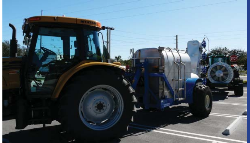
Heavy equipment displays