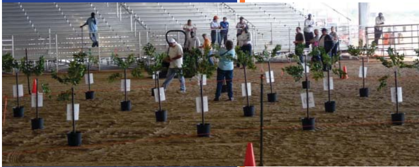
A temporary citrus nursery was set up for disease identification and mower competitions