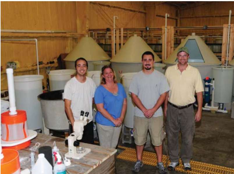
IRREC Aquaculture Team