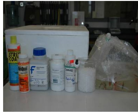
Figure 1. Typical transport additives

Typically, fish are harvested from a pond and placed into a transport container that is filled with water and covered with a lid (see UF IFAS Fact Sheet FA-117 Harvesting Ornamental Fish from Ponds ). Some commonly used transport containers in Florida include: 1) polystyrene shipping boxes, 2) plastic boxes/tubs, 3) galvanized metal tubs, 4) wood/fiberglass boxes, and 5) 55-gallon plastic barrels. Following harvest, fish are transported to a holding facility (Figure 2). The facility is generally a