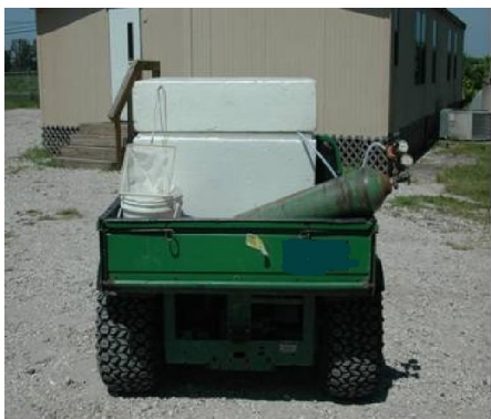
Figure 2. A transportation vehicle

when transporting fish. Poor water conditions can adversely affect the immune system of the fish, increase susceptibility to disease, and may lead to illness or death. Determine these differences before moving the fish, and, if necessary, make adjustments to the water. Then acclimate the fish. Acclimation is the process of slowly introducing the fish to different quality water to allow physiological adjustments to occur gradually over time.