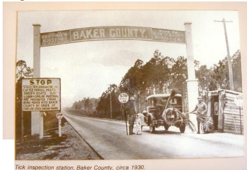
Tick inspection station, Baker County, circa 1930.